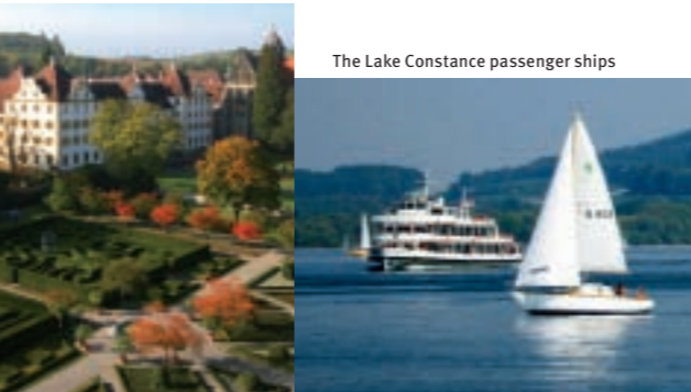
The Lake Constance passenger ships